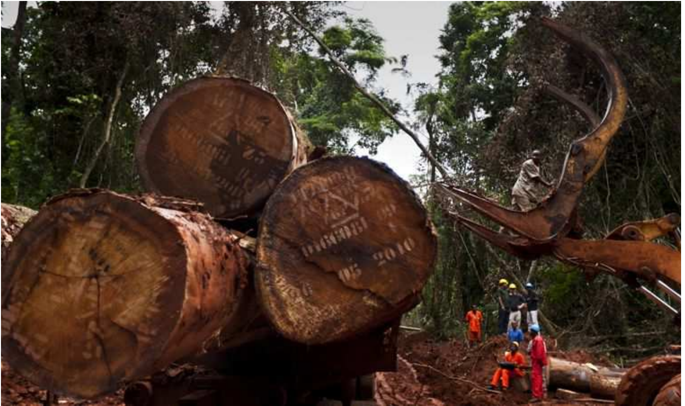
Workers cut down trees in southeast Cameroon as part of a sustainable initiative to help local groups with forest management.

In South Africa and Australia, businesses wanting to encroach on ecosystems that are classed as critically endangered or endangered must first conduct a full environmental impact assessment for their proposed project. Likewise, Finland's first government-led systematic ecosystem assessment, completed in 2008, resulted in increased protection of threatened forest under the nation's Environment Protection Act and Forest Act 17 .