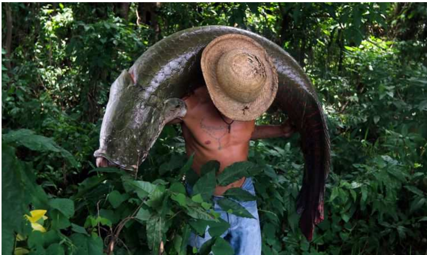
Human impacts such as overfishing have affected the Amazon River ecosystem in Brazil.

Ecosystems, from the boreal forest and wetlands to coral reefs and mangroves, are more than the total of the plants and animals living in them 5 . Complex interactions between biological and physical systems drive processes that sustain all life. This includes production of clean water, regulation of air quality and climate through carbon sequestration and storage, soil formation, pollination and the production of food and wood for houses 1 . Indeed, natural systems are key to dealing with the effects of climate change, as highlighted by a 2019 study 6 . It estimated that, between 2000 and 2013, the impact on carbon levels of losing intact tropical forests (including indirect effects such as reduced biodiversity and increased selective logging) might be six times greater than was originally proposed 6 .