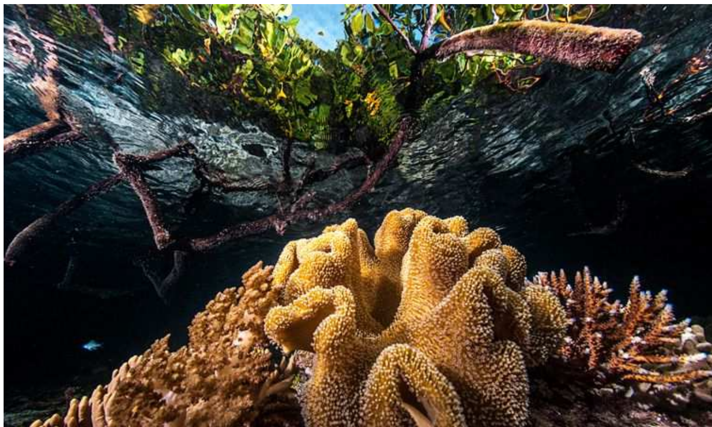
Coral in a mangrove swamp in the Raja Ampat Islands, Indonesia.